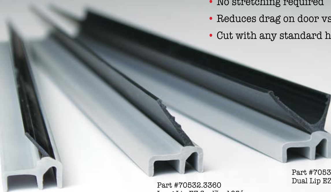
Part #70531.3360 Standard Lip EZ Seal™ - 105"