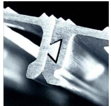
Interlocking panel system adds strength to the ramp construction.